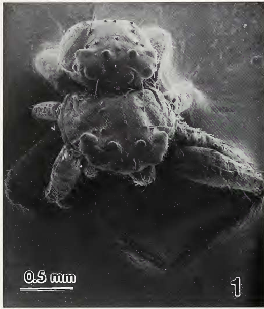
Figure 1.—Scanning electron micrograph of anomalous Misumenops sp. thomisid, dorso-lateral view.